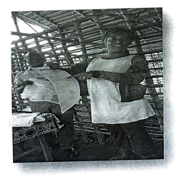
Explanation of the SESRR results