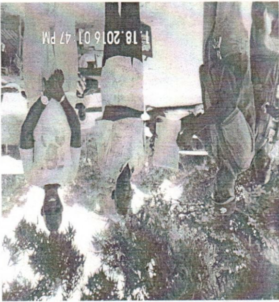
Meeting our traditional chiefs for the tradition welcome of the team member in Gbeh Town. Presenting the SFR Letter to the Hon. Commissioner of Sarbo District Kiteabo Chieftdom.